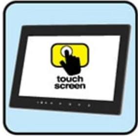
[ GFC Series ]